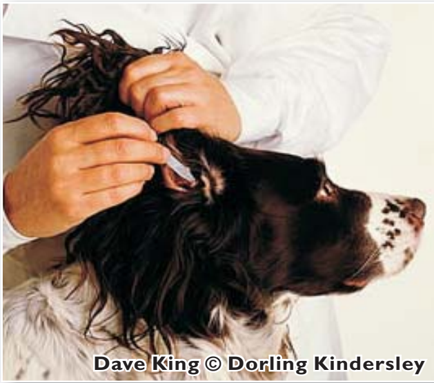
Dave King © Dorling Kindersley